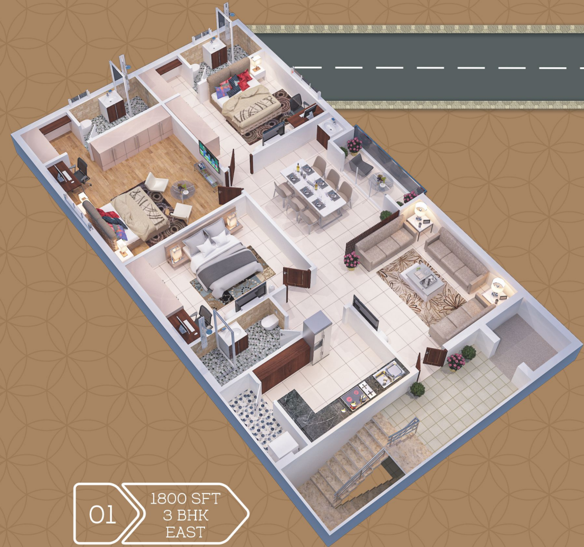
01 1800 SFT 3 BHK EAST