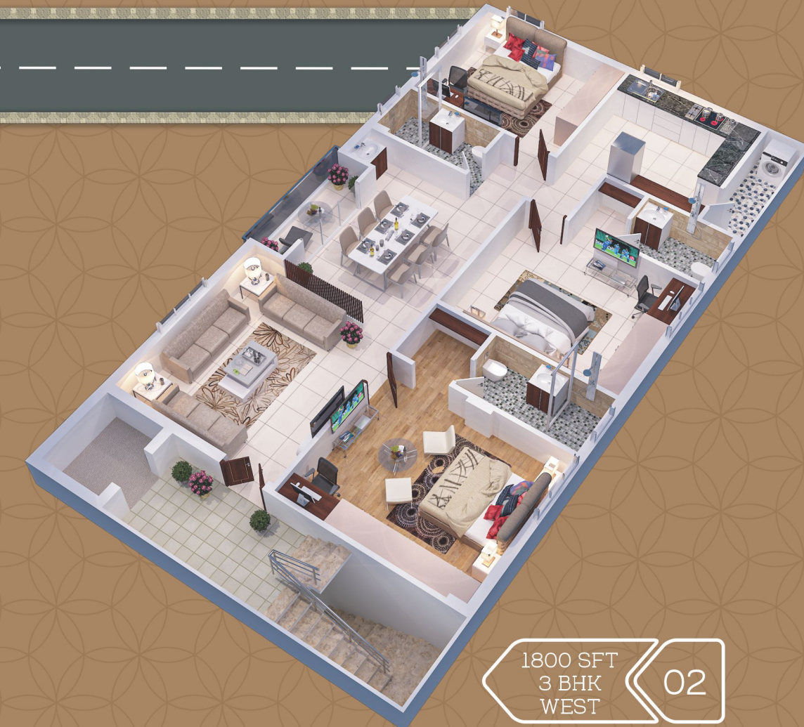
02 1800 SFT 3 BHK WEST